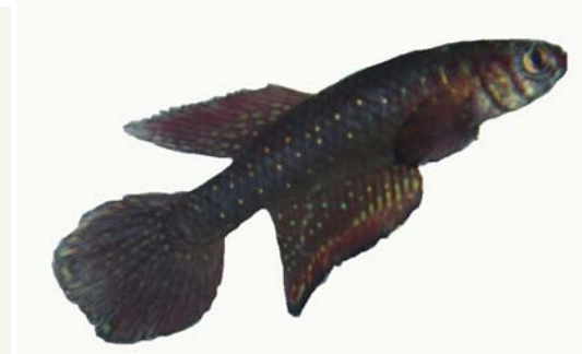
Fundulus. zebrius Plano Nematolebias papilliferus