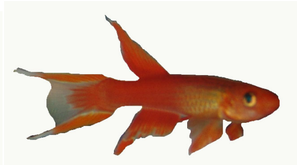
N. lourensi Lupino TAN 00/15