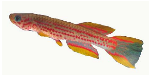
A. hanneloreae GEB 94/21