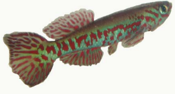
Fundulopanchax puerzli Aphyosemion raddai HAH 98