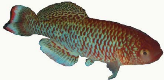
Procatopus similis Muyuka (wild) Nothobranchius kafuensis Kayuni ZAM 97-9