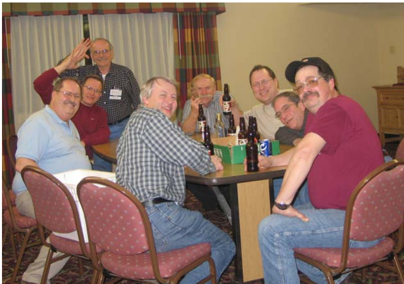
This was the CKA discussion group saying, "You all come back now, ya hear!"