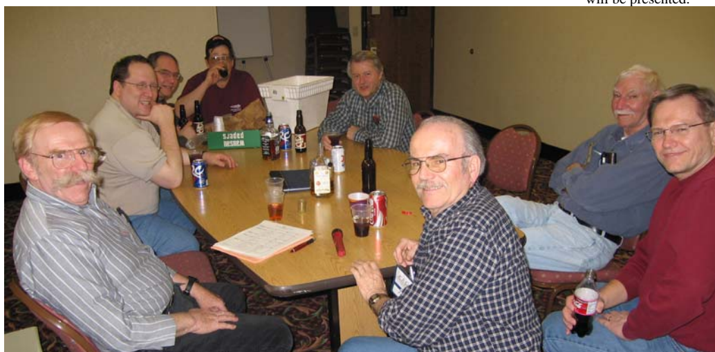
This group formed the 1 st ever CKA Show Critique Group. This is where the hard questions were met with tough answers. Totally serious debates ranged for several hours. At times, you could hardly hear yourself...not for the meek. These seldom seen photos are rarely shown, due to the sometimes traumatic scars left. Prolonged exposure should be avoided. We are "Professionals"!